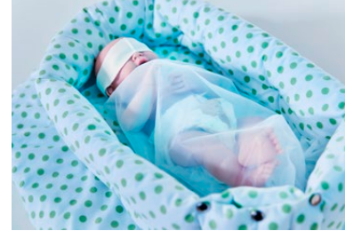
BiliTex cloth 60x60cm REF 18-06-100